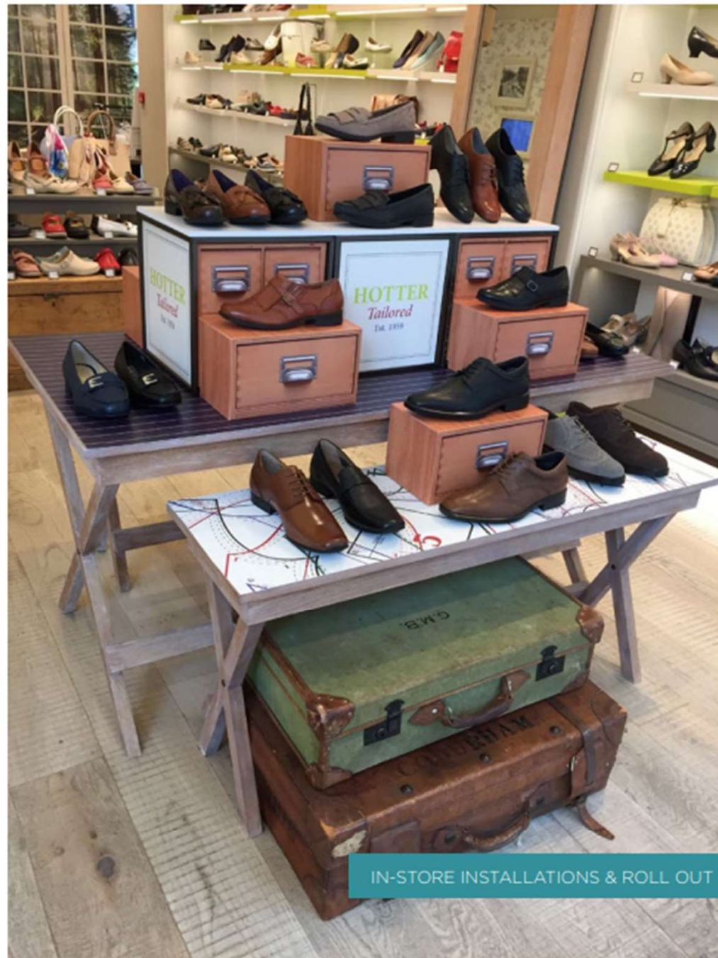
IN-STORE INSTALLATIONS & ROLL OUT